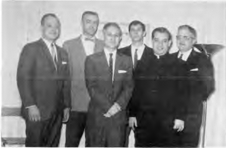
National Officers and officers of the Columbus Alumni Association and Beta Xi at the dedication of the new Xi House.

The members of Xi Chapter at Ohio State University have entered their fortieth year of successful operation. The Chapter, founded in 1923, marked its anniversary with the dedication of its newly renovated house.